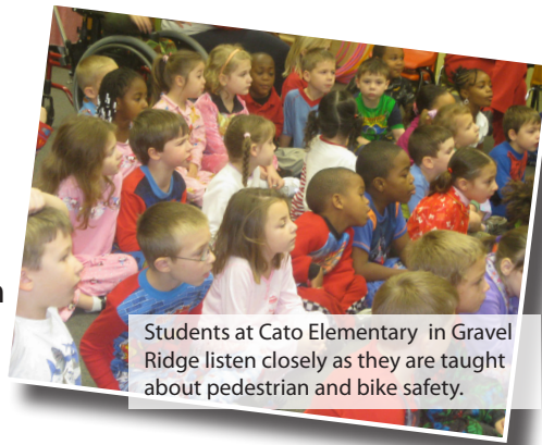
Students at Cato Elementary in Gravel Ridge listen closely as they are taught about pedestrian and bike safety.

At the core of the IPC are education efforts to both the general public and professionals. The results of research outcomes are utilized to guide the educational strategies with the goal of changing behaviors to keep Arkansans safer. The public is reached through media and coordinated public events. Professionals who receive injury prevention education include those in the medical, education, and public health fields.