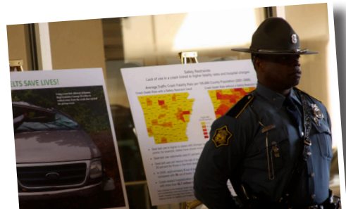
Press conference for motor vehicle safety held in February 2009 at Arkansas Center for Health Improvement.

The 2009 legislative session also saw passage of primary seat belt law, prohibition of text messaging by all drivers, prohibition of selling dangerous products such as novelty lighters, and improvements in boating safety. Other states that have laws like these have seen dramatic decreases in injury and death. Arkansas looks to the future to see these trends for our state as well.