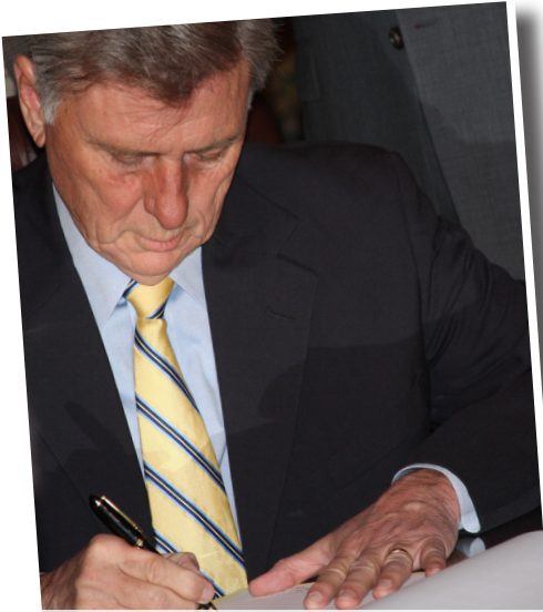
Making it official -- Governor Mike Beebe signs into law plans for a Trauma System and Graduated Driver's Licensing in March 2009.