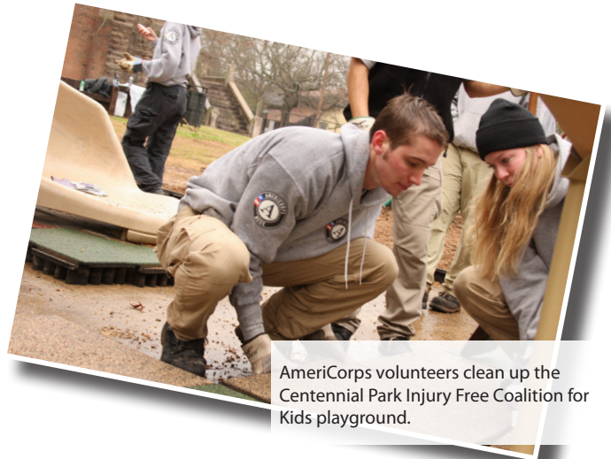
AmeriCorps volunteers clean up the Centennial Park Injury Free Coalition for Kids playground.

Volunteers are critical to the success of IPC. This year, the IPC worked with ACH Volunteer Services to teach students about injury prevention efforts through service learning. Alternative Break students from Northwestern University completed a walkability assessment of Martin Luther King Junior Elementary. A walkability assessment allows the school to identify any safety concerns for children to walk to school safely. AmeriCorps volunteers assisted with community educational events and also completed a playground clean up day at the Centennial Park playground built by the Injury Free Coalition for Kids.