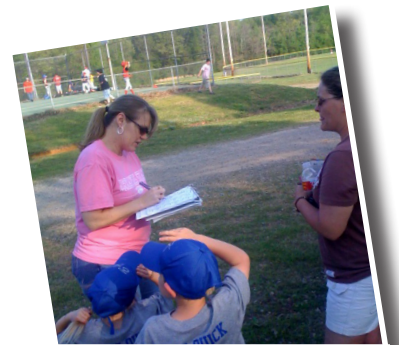
Information is collected by volunteers at a Strike Out Child Passenger Injury observational survey held in the Spring of 2008.

This project was selected for a poster presentation at the NACHRI Creating Connections Conference and the 9th Annual World Conference on Injury Prevention and Safety Promotion. Preliminary results were also presented at a luncheon hosted by NACHRI at the Safe Kids Worldwide Conference. An abstract titled “Disseminating Booster Seat Evidence with Community Sports,” was selected for an oral presentation in the Translational Research session at the Society for Advancement of Violence and Injury Research Conference.