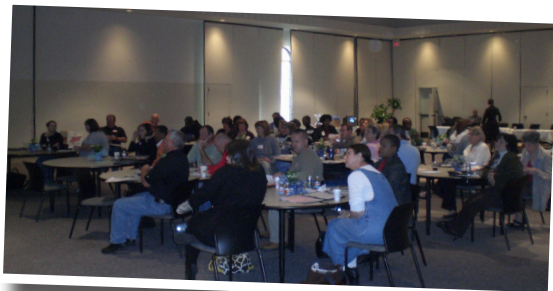
Attendees at the inaugural Informed Choices = Injury Prevention conference held in November 2008.

Medical students receive injury prevention education throughout their UAMS training. First- and second-year medical students receive injury prevention lectures to understand the scope of the problem and what they can do to prevent injuries. In their junior year the students learn more in-depth anticipatory guidance on child passenger safety, recreational safety, and home safety. The students learn how to effectively complete a well child check-up visit incorporating injury prevention.